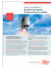
Leica ScanStation 2 Product information and specifications