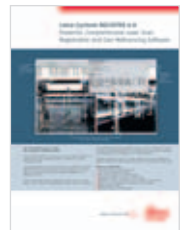
Leica Cyclone 6.0 REGISTER Product information

Business Unit Scanning: Leica Geosystems HDS LLC 4550 Norris Canyon Road San Ramon, USA, CA 94583 +1 925 790-2300