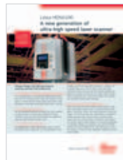
Leica HDS6100 Product information and specifications

Laser class 3R in accordance with IEC 60825-1 resp. EN 60825-1