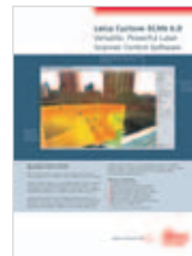
Leica Cyclone 6.0 SCAN Product information